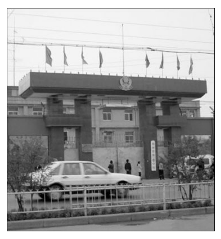
The front gate of the Zhengzhou Prison. When I escaped, these gates were standing open and I walked out!