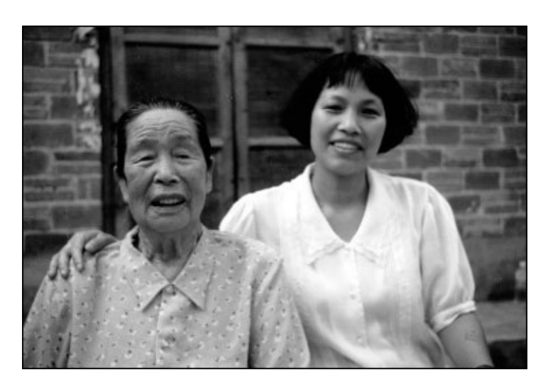
This picture of my mother and wife was taken soon after my escape from prison in 1997. I never saw my mother's face again.