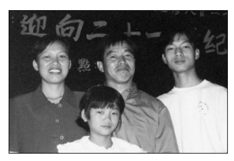
With my family in Myanmar (Burma), 2000.