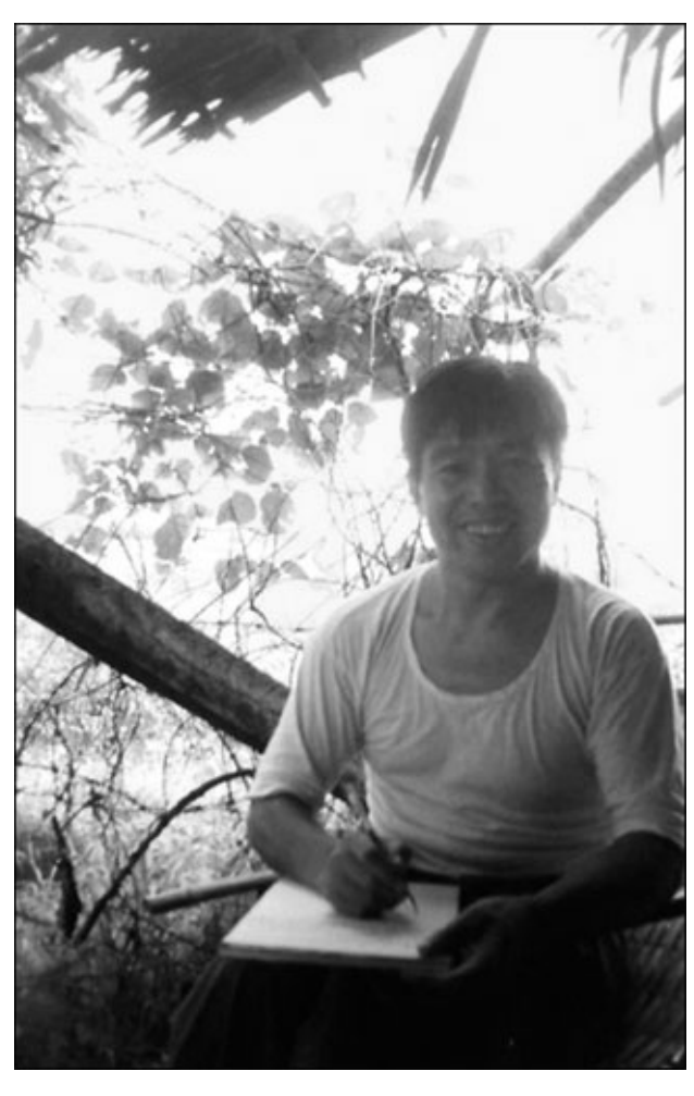
Writing in my journal at the courthouse in Yangon, Myanmar, while waiting for sentencing.