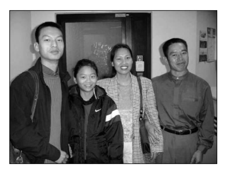
Finally we were together again! My family warmly welcomes me back from prison, Frankfurt, September 2001.